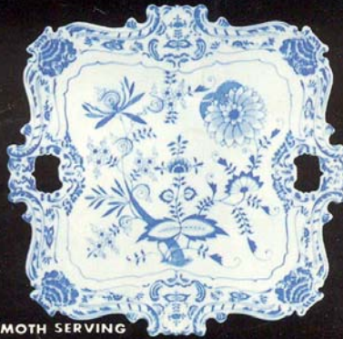
MAMMOTH SERVING TRAY Turns hors d'oeuvres into chefs d'oeuvres. 15" sq. No. 25/70