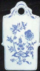
SAY "CHEESE" TRAY Everybody smiles when you serve this sampler. No. 25/113