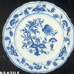
VERSATILE DESSERT PLATE Just one size serves salad and dessert! 8 No. 25/8