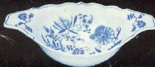
OLD VIENNA. Deep Lug Dish. 8 1/2" of delightful hostess uses. No. 25/119