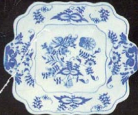
OLD WORLD SQUARE SERVER Simply styled, simply terrific. Occasion after occasion. No. 25/122