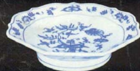
OCTAGON ASHTRAY 6 1/4". You'll appreciate it eight great ways. No. 25/117