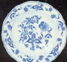
RIM SOUP PLATE The rim does it! perfect for "neatifying" stews and spaghetti, too. 8 1/2" in diameter. No. 25/16