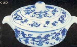
THE 1 QT. GOURMET CASSEROLE For delicious hot treats. Thermo shock-tested china. 7" wide. No. 25/505