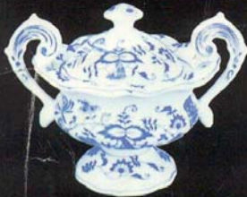
MAYONNAISE JAR MAJESTIC A regency favorite. And favored for cheese dips, candy and sugar, too. No. 25/77