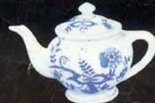
TETE A TEA For intimate little breakfasts for two. No. 25/82