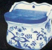
HANOVER SALT BOX A favorite design of yester-year still favorite. With hinged wooden cover. No. 25/56