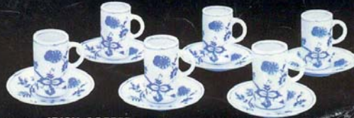
IRISH COFFEE. It's like finding the proverbial "pot o' gold". No. 250/2