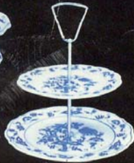
THE TWO TIER SERVER Treat informal company royally with sandwiches and hors d'oeuvres displayed on this delectable server. No. 25/75 6" and 8" plates — polished loop handle — 8 1/2" high.