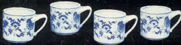
45 pc. SET 25/set 45 Service for 8