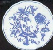
HOT PLATE TILES The stylish way to protect your table tops. 5 1/4" diam. No. 25/73