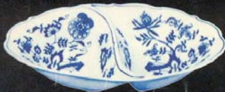
DIVIDED VEGETABLE Two-throned vegetable dish. delicious idea. Let's you serve two vegetables at once. 25/74