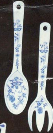
THE SALAD SERVERS The little bit of extra "dressing" delectable salads need. No. 25/114