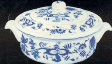
THE 1 1/2 QT. GOURMET CASSEROLE 8" wide. No. 25/506