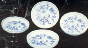
4-PC. COASTER SET The perfect gift for the perfect hostess 3 1/2" diam. No. 25/71