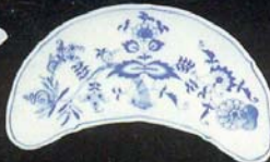
THE BONE DISH The perfect accessory side dish. Throw it a bone. Or simply for salads or vegetables. No. 25/38