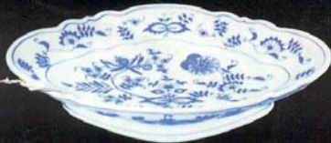
JUMBO LOBSTER DISH So unusual, yet so enduringly practical. Also makes a beautiful fruit bowl with base. No. 25/42