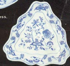
TRIANGLE DISH A gem of a setting for sweets, cakes or appetizers. No. 25/112