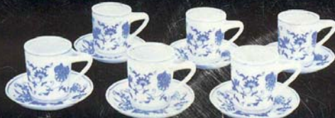
OLD VIENNA COFFEE CUP/SAUCER-SET Graciously recaptures the charm of Old Vienna. No. 250/3