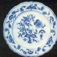
THE BREAD & BUTTER PLATE, 6 No. 25/7