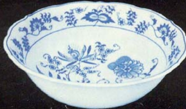
SALAD BOWL 10 The "just-right" family-size server. No. 25/105