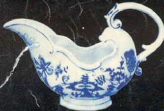
THE GRAVY BOAT Beautiful old world design. 9 1/4 Long fluted spout of a Kingly visage. No. 25/92