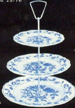
THE THREE-TIER SERVER Three-tiers high of good tastes when company comes. No. 25/76