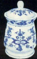
CANDY JAR PALATIAL For all sorts of pleasures and treasures. Cookies, too. Or as a canister. No. 25/111