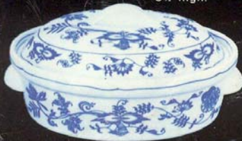
1 1/2 QUART OVAL CASSEROLE The perfect answer when whipping up delicious "1-dish meals". 9" in length. No. 25/509