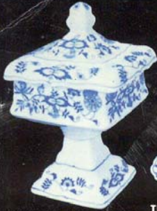
THE WEDDING BOWL A traditional tier-shape candy box. It's enough to make a marriage happy! Collectors love them too. No. 25/85