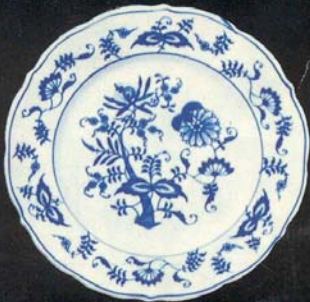
THE DINNER PLATE Blue Danube Elegance. 10 No. 25/9